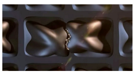
Take care while cleaning. If a substance has dried on the cushion and sticks cells together, do not attempt to separate the cells when they are dry. This may damage the cushion.